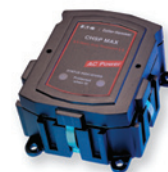
Whole Home Protection